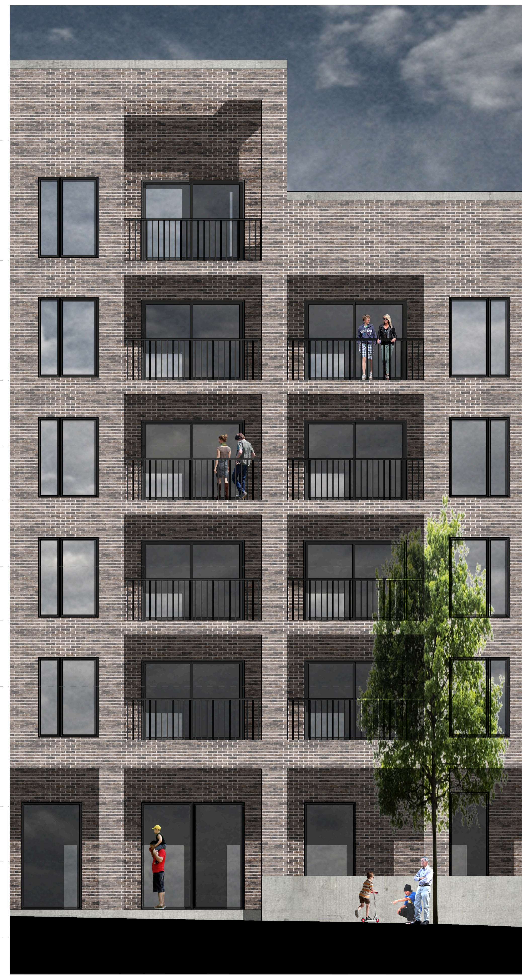
1 Block B Elevation Study